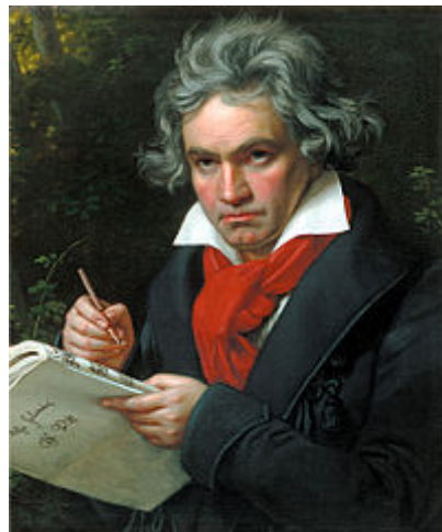
1820 Beethoven Portrait, by Joseph Karl Stieler

In a way, he was banished. Separated from the hearing world—in which people listened to his music—Beethoven heard nothing as the sound of his compositions echoed throughout Europe.