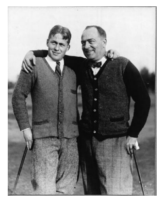
Bobby Jones with his Father Image online, historical golf photos.

View this asset at: <a href="http://www.awesomestories.com/asset/view/1930-Grand-Slam0">http://www.awesomestories.com/asset/view/1930-Grand-Slam0</a>