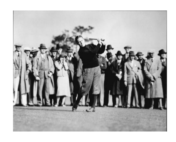
1930 Grand Slam