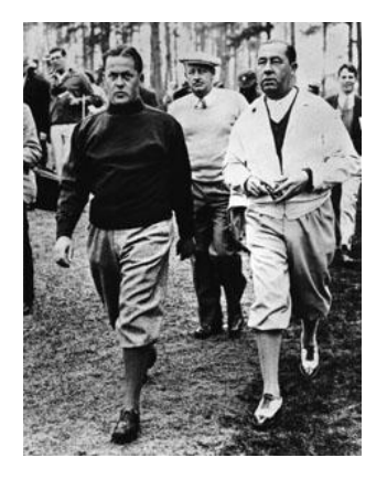
Jones and Hagen

View this asset at: <a href="http://www.awesomestories.com/asset/view/Bobby-Jones">http://www.awesomestories.com/asset/view/Bobby-Jones</a>