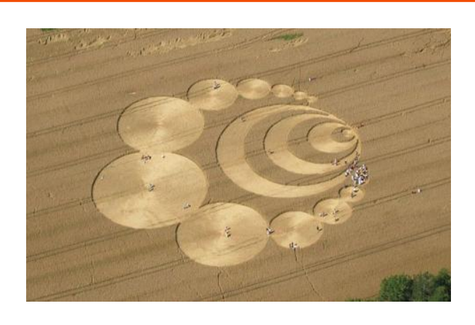
Photo of Crop Circle in Switzerland - in 2007 - by Jabberocky. Image online, courtesy Wikimedia Commons.

Nobody ever sees them formed. We usually come across them when we are working in the fields.