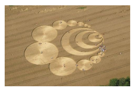
Signs - A Story of Crop Circles View this asset at:

View this asset at: <a href="http://www.awesomestories.com/asset/view/Headbourne-Worthy">http://www.awesomestories.com/asset/view/Headbourne-Worthy</a>