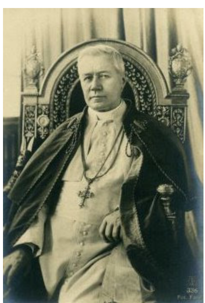
Pope Pius X

View this asset at: <a href="http://www.awesomestories.com/asset/view/">http://www.awesomestories.com/asset/view/</a>