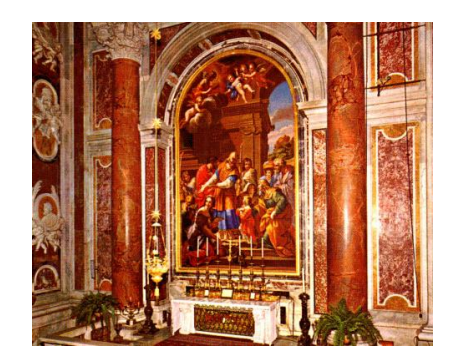
Pius X Opposed WWI - Buried at St. Peter's Basilica View this asset at: <a href="http://www.awesomestories.com/asset/view/">http://www.awesomestories.com/asset/view/</a>