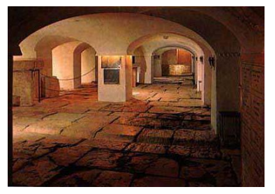
<u>Trial of Jesus - Possible Prison, Herodian Fortress</u>

http://www.awesomestories.com/asset/view/Trial-of-Jesus-Possible-Prison-Antonia-Fortress