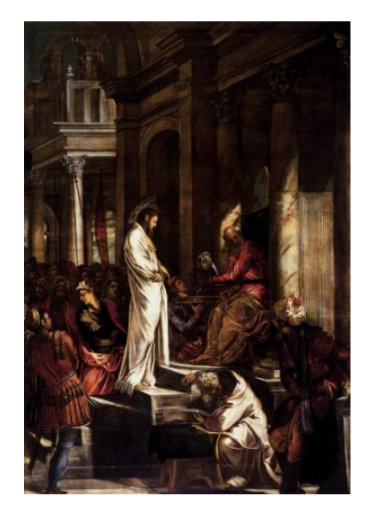
<u>Trial of Jesus - Interrogation by Pilate</u> Image online, courtesy Wikimedia Commons. View this asset at: <a href="http://www.awesomestories.com/asset/view/Trial-of-Jesus-Interrogation-by-Pilate">http://www.awesomestories.com/asset/view/Trial-of-Jesus-Interrogation-by-Pilate</a>