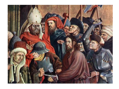
Trial of Jesus - Charged Before Pilate

http://www.awesomestories.com/asset/view/Trial-of-Jesus-Possible-Prison-Herodian-Fortress