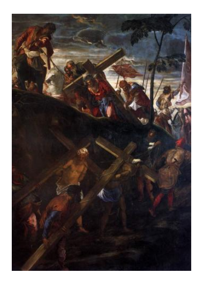
<u>Journey to the Execution Site</u> Image, described above, online courtesy Web Gallery of Art. PD