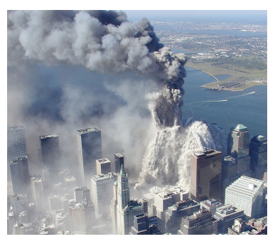
1 WTC Collapsing

View this asset at: http://www.awesomestories.com/asset/view/