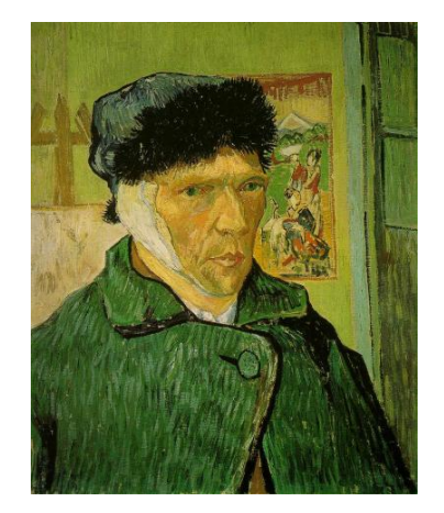
Self-Portrait with Bandaged Ear

View this asset at: http://www.awesomestories.com/asset/view/Saint-Remy-Asylum