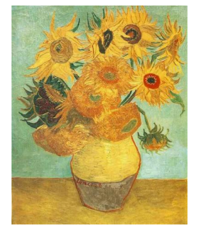
Vase with Twelve Sunflowers - January, 1889