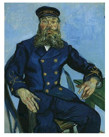
<u>Portrait of the Postman Joseph Roulin</u>

http://www.awesomestories.com/asset/view/Portrait-by-van-Gogh-Dr.-Felix-Ray