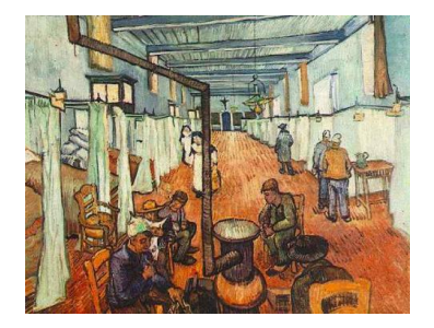
Reinhart - Ward in Hospital at Arles

http://www.awesomestories.com/asset/view/Reinhart-Courtyard-of-Hospital-at-Arles