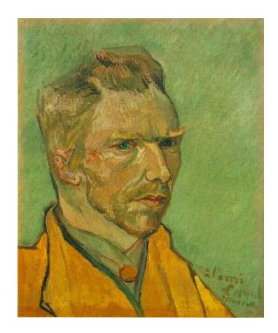
<u>Self-Portrait - van Gogh, December 1888</u>