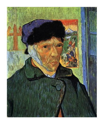
THE BANDAGED EAR

View this asset at: <a href="http://www.awesomestories.com/asset/view/Vincent-s-Hospital-in-Arles">http://www.awesomestories.com/asset/view/Vincent-s-Hospital-in-Arles</a>