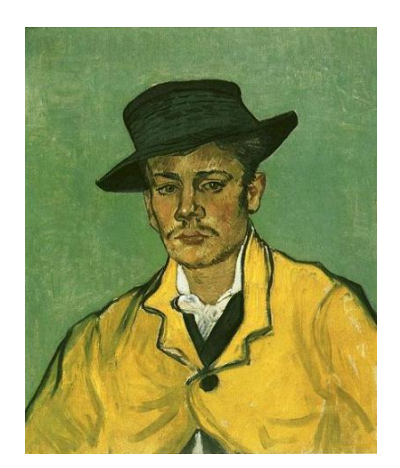
<u>Armand Roulin - Portrait by van Gogh</u>

View this asset at: http://www.awesomestories.com/asset/view/Portrait-of-Marcelle-Roulin-1888