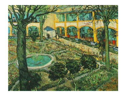
Reinhart - Courtyard of Hospital at Arles