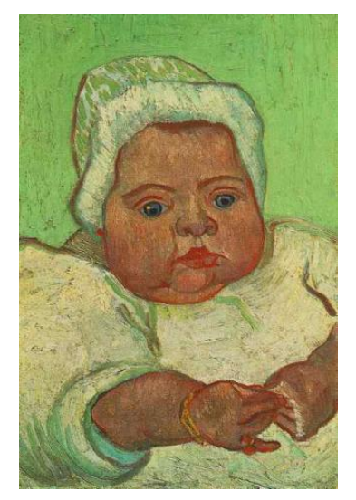
Portrait of Marcelle Roulin, 1888 Image online, courtesy Web Gallery of Art.

http://www.awesomestories.com/asset/view/Self-Portrait-van-Gogh-December-1888