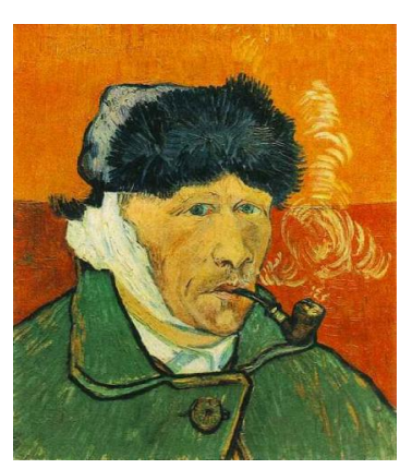
van Gogh - Self-Portrait with Bandaged Ear and Pipe

View this asset at: http://www.awesomestories.com/asset/view/Self-Portrait-with-Bandaged-Ear