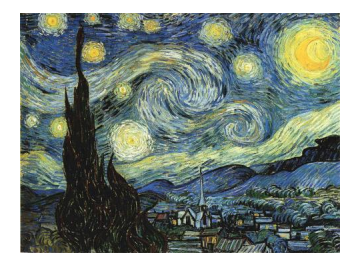
Starry Night - Vincent's Famous Painting Image online, courtesy Web Gallery of Art.

http://www.awesomestories.com/asset/view/Poppies-Vincent-s-Early-June-1889-Painting