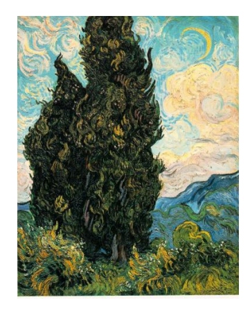
June, 1889 - Vincent's Cypresses Image online, courtesy Web Gallery of Art. PD

View this asset at: <a href="http://www.awesomestories.com/asset/view/June-1889-Vincent-s-Cypresses">http://www.awesomestories.com/asset/view/June-1889-Vincent-s-Cypresses</a>