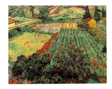
<u>Poppies - Vincent's Early June, 1889 Painting</u> Image online, courtesy Web Gallery of Art. PD