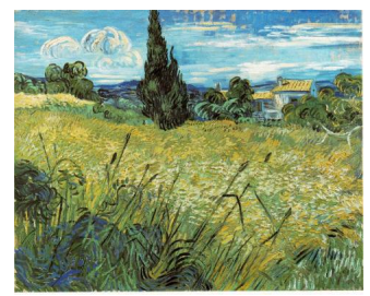
Wheat Field with Cypress - June, 1889

View this asset at: <a href="http://www.awesomestories.com/asset/view/June-1889-Vincent-s-Cypresses">http://www.awesomestories.com/asset/view/June-1889-Vincent-s-Cypresses</a>