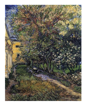
VINCENT at SAINT-REMY

View this asset at: http://www.awesomestories.com/asset/view/Starry-Night-Vincent-s-Famous-Painting