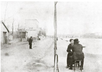
Photo - Vincent van Gogh with Emile Bernard, 1886

View this asset at: http://www.awesomestories.com/asset/view/View-from-the-Ravoux-Inn