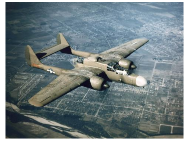
P-61 Night Flyer

View this asset at: http://www.awesomestories.com/asset/view/Map-of-Pampanga-River