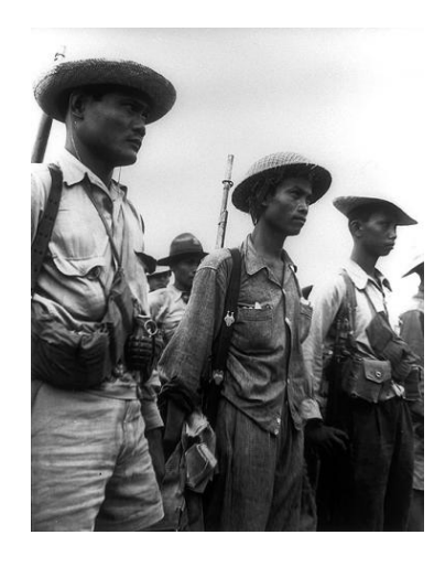
Juan Pajota and the Great Raid