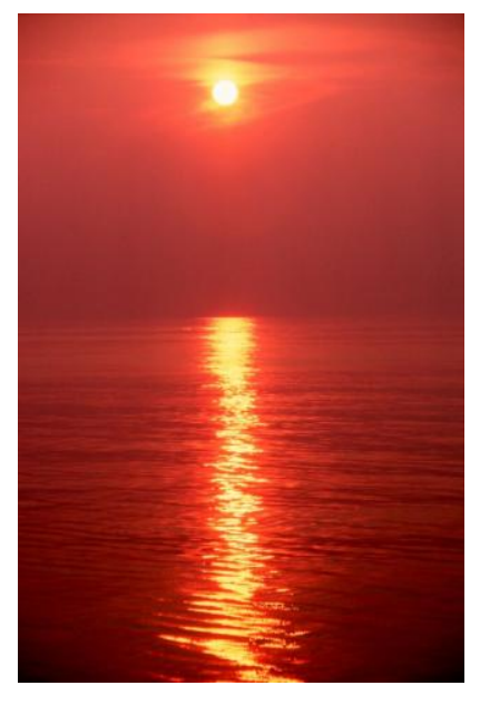
Sunset Over the Ocean Photo online, courtesy NOAA. View this asset at:

http://www.awesomestories.com/asset/view/Sunset-Over-the-Ocean