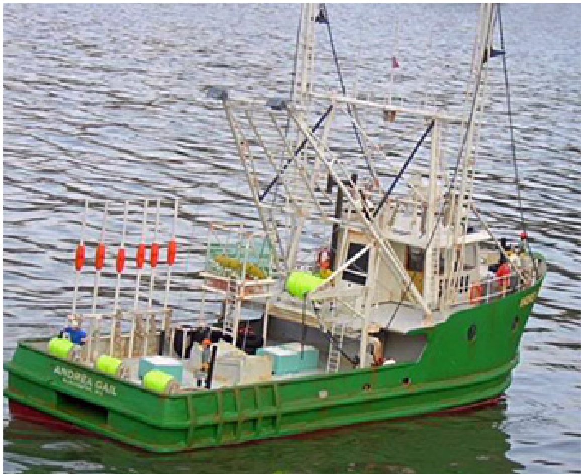
Andrea Gail, the ship which was lost during 1991's "Perfect Storm."