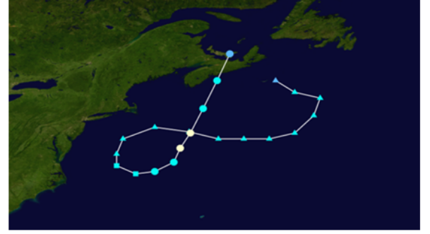
Track of the Perfect Storm (Unnamed 1991 Hurricane) from October 28<sup>th</sup> – November 4<sup>th</sup>

This image depicts the tracking of a massive 1991 storm (in the North Atlantic) known as "The Perfect Storm."