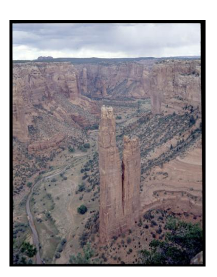
<u>Canyon de Chelly</u> Image online, courtesy the U.S. National Archives. PD

http://www.awesomestories.com/asset/view/Navajo-Nation-Tseyi-Overlook