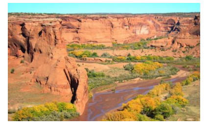
Navajo Nation - Tseyi Overlook National Park Service. Public Domain. View this asset at: