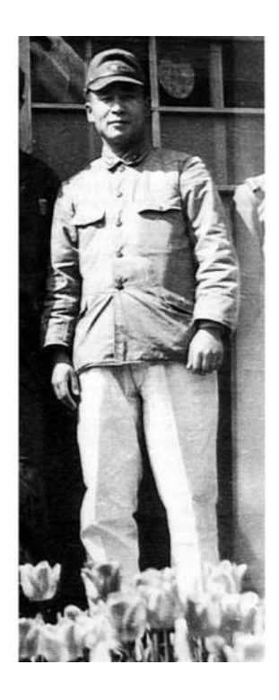
THE BIRD - THEN AND LATER

View this asset at: <a href="http://www.awesomestories.com/asset/view/">http://www.awesomestories.com/asset/view/</a>