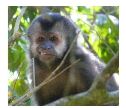
Iguazu - Capuchin Monkey on the Upper Trail

http://www.awesomestories.com/asset/view/lguazu-Falls-Map-Depicting-Location