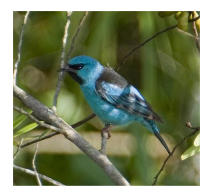
Iguazu Falls - Blue Dacnis

http://www.awesomestories.com/asset/view/Iguazu-Capuchin-Monkey-on-the-Upper-Trail