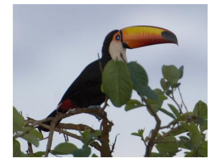
<u>Iguazu Falls - Toco Toucan</u>

View this asset at: <a href="http://www.awesomestories.com/asset/view/lguazu-Falls-Blue-Dacnis">http://www.awesomestories.com/asset/view/lguazu-Falls-Blue-Dacnis</a>