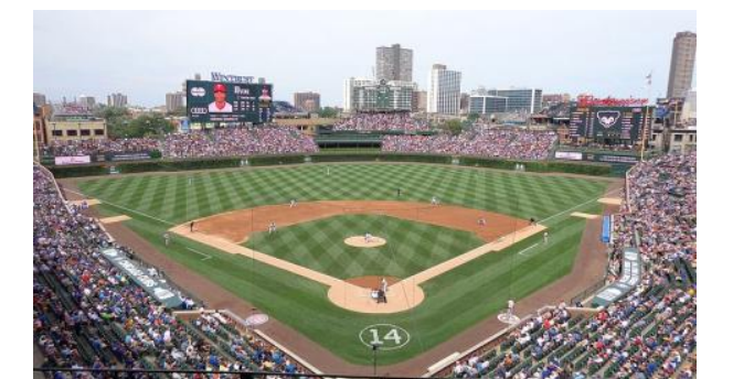
Photo depicting Wrigley Field, home of the Chicago Cubs, as it appeared on July 24, 2015 (when the Cubs played the Philadelphia Phillies). Wrigley Field has a capacity of 41,268 (although its reported record attendance—on May 18, 1947 in a game against the Brooklyn Dodgers—was 47,101). The field opened, for play, on April 23, 1914 (a few months before WWI erupted in Europe).

The game of Base Ball has now become beyond question the leading feature of the out-door sports of the United States.