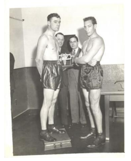
Image online, courtesy the freewebs.com website. View this asset at: <u>http://www.awesomestories.com/asset/view/Max-Baer-and-Primo-Carnera</u>

Jimmy Braddock and Art Lasky Image online, courtesy Wikimedia Commons. View this asset at: http://www.awesomestories.com/asset/view/Jimmy-Braddock-and-Art-Lasky