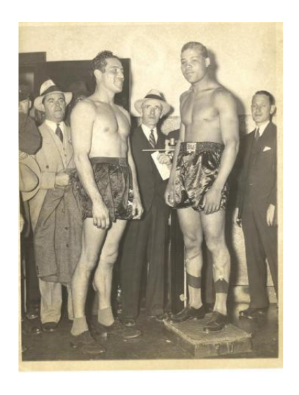
Joe Lewis and Max Baer

Image of Louis and Baer, online courtesy Wikimedia Commons. View this asset at: