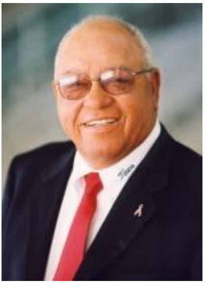
Herman Boone Photo

http://www.awesomestories.com/asset/view/Remember-This-Titan-by-Steve-Sullivan