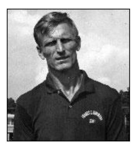
<u>Bill Yoast</u> View this asset at: <a href="http://www.awesomestories.com/asset/view/Bill-Yoast">http://www.awesomestories.com/asset/view/Bill-Yoast</a>

View this asset at: http://www.awesomestories.com/asset/view/Herman-Boone