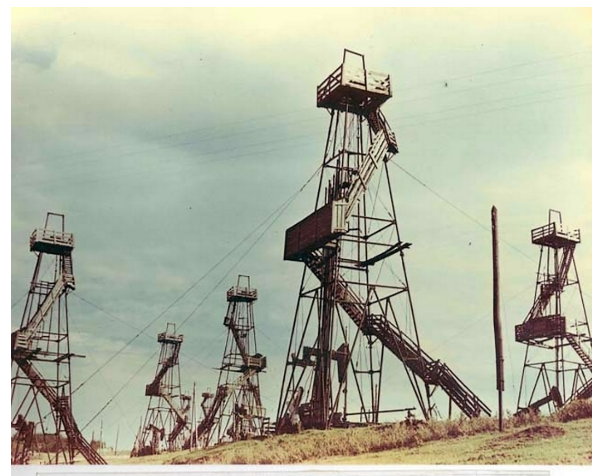
Не ф тяные вышки - Старые промысла

Hitler's actual plans, to capture the Soviet-controlled oil fields, ended-up in Stalin's hands (although he didn't believe they were real). We learn more about that incident from the UK's History Learning Site: