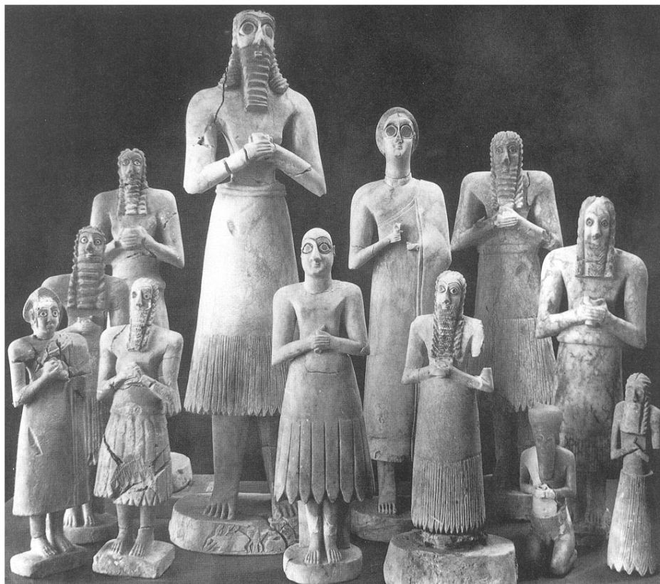
Votive statues from the Square Temple, Eshnunna (modern Tell Asmar, Iraq). c. 2900 - 2600 BCE. Limestone, alabaster, and gypsum. The Oriental Institute of The University of Chicago; Iraq Museum, Baghdad.

Scholars believe that the Laws of Eshnunna pre-date the Code of Hammurabi, although they are not sure by how many years. The likely date for the Eshnunna Code is sometime in the 20th Century B.C.