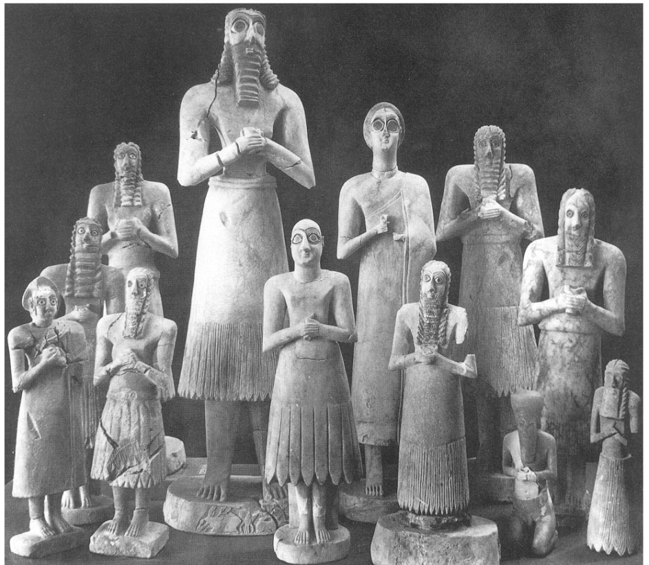
Votive statues from the Square Temple, Eshnunna (modern Tell Asmar, Iraq). c. 2900 - 2600 BCE. Limestone, alabaster, and gypsum. The Oriental Institute of The University of Chicago; Iraq Museum, Baghdad.

Scholars believe that the Laws of Eshnunna pre-date the Code of Hammurabi, although they are not sure by how many years. The likely date for the Eshnunna Code is sometime in the 20th Century B.C.